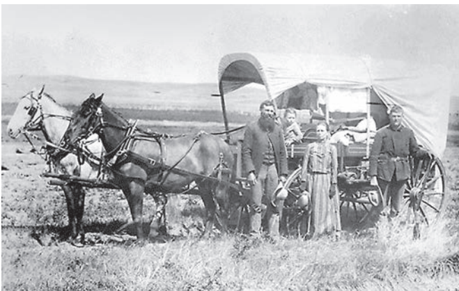
Family with their covered wagon during the Great Western Migration, 1866

souri. Many pioneers set out from there in their wagons on a 3,000 km overland route which took them down the Missouri River, through the Great Plains across the Rocky Mountains and finally into Oregon. People took time in migrating to the West, pausing for a year or more in several places before reaching their final destination. When settle-