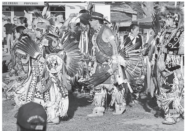
Reviving Native American heritage: Powwow in northern Wisconsin

About one-third of today’s 2.9 million Native Americans live in the states of California, Arizona and Oklahoma. Where natural resources (coal, oil, natu-